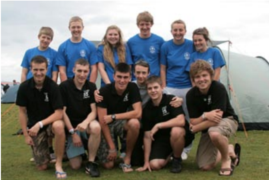
The Ten Tors teams

Both teams completed the event with excellent times, arriving back at Okehampton camp within five minutes of each other just before midday.