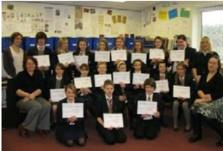
Year 8 students from St Cuthbert Mayne School complete the DECIPHer- ASSIST programme.

Pupils in year eight at St Cuthbert Mayne School have become the first students in Torbay to complete a 14 week smoking prevention course known as DECIPHer-ASSIST.