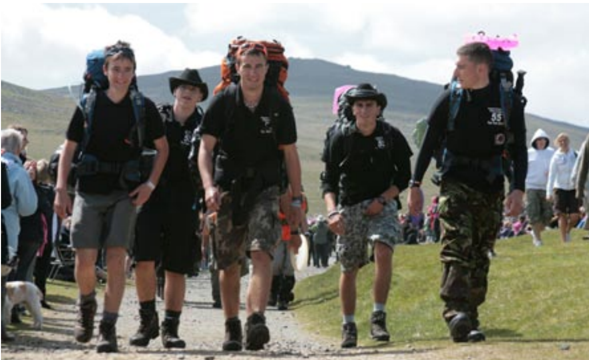
The Ten Tors 55 mile finish